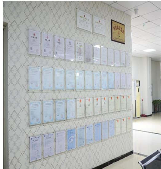
Fame Certificates Wall

Tel: +86-769-33657987 Website: www.zltester.com