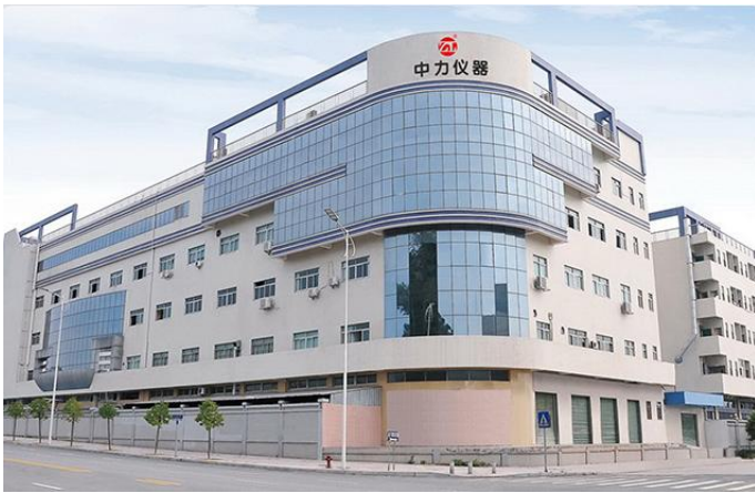
Company outdoor view